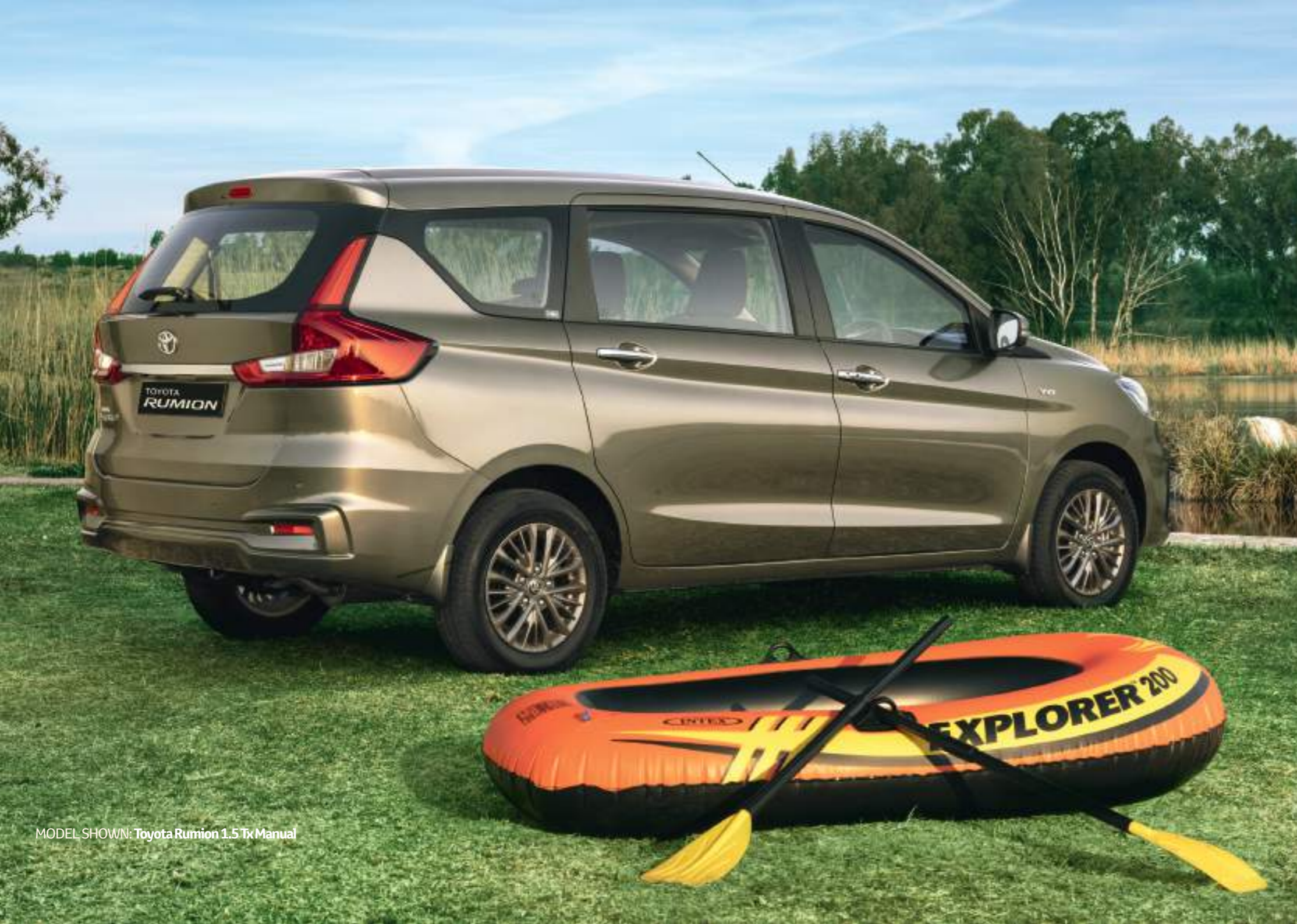
MODEL SHOWN: Toyota Rumion 1.5 Tx Manual