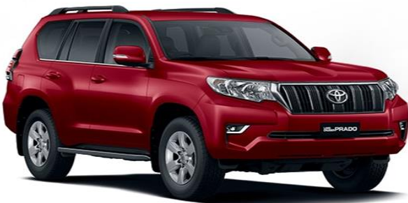
3R3 Red Mica Metallic