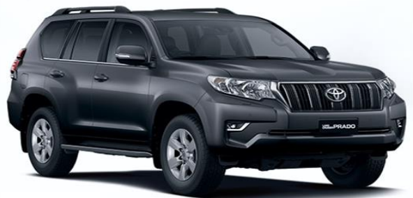
1G3 Grey Metallic