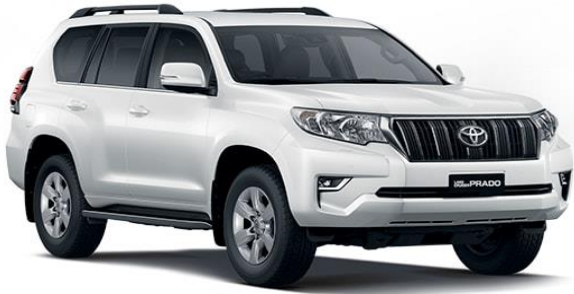
040 Super White