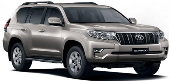
4V8 Avant-Garde Bronze