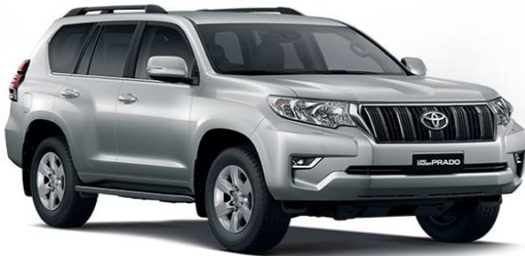
1F7 Silver Metallic