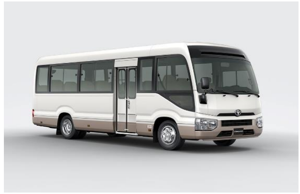
2JP White / Beige