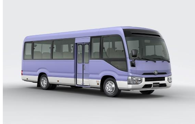
2KA Lavender Blue / White