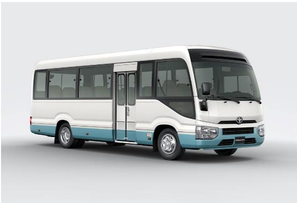
2HL White / Turquoise