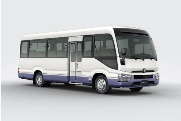
2DT White / Lavender