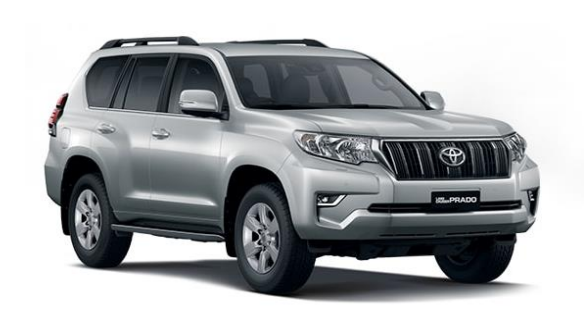
1F7 - Silver Metallic