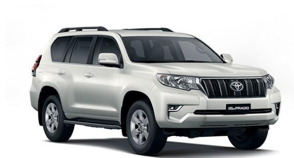
070 - White Pearl