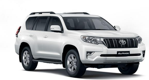
040 - Super White