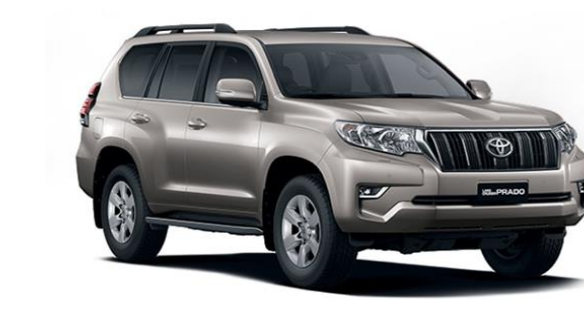
4V8 - Avante- Garde Bronze Metallic