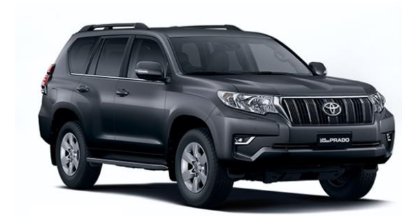
1G3 - Grey Metallic