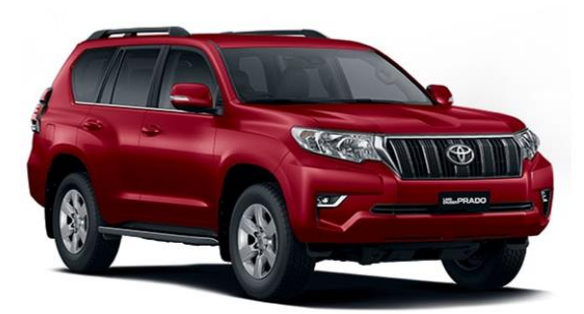
3R3- Red Mica Metallic