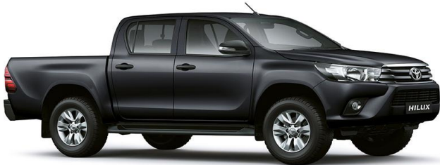
1G3 Gray Metallic