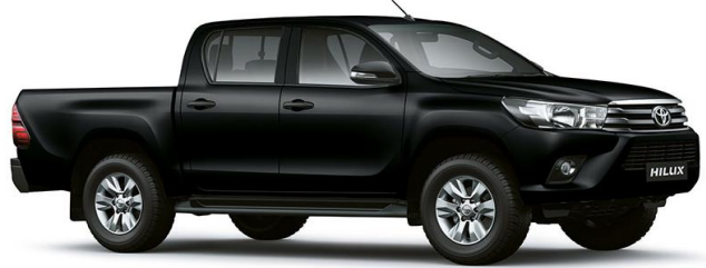
218 Attitude Black