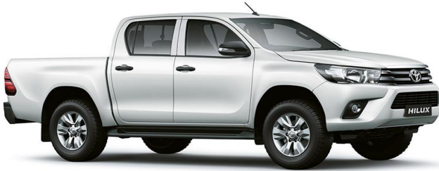
040 Super White II