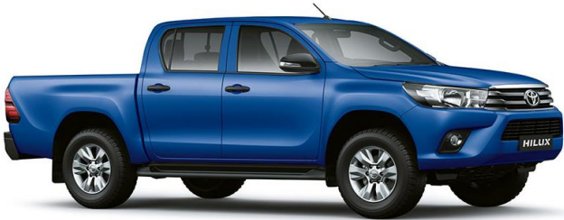
8X2 Nebula Blue Metallic