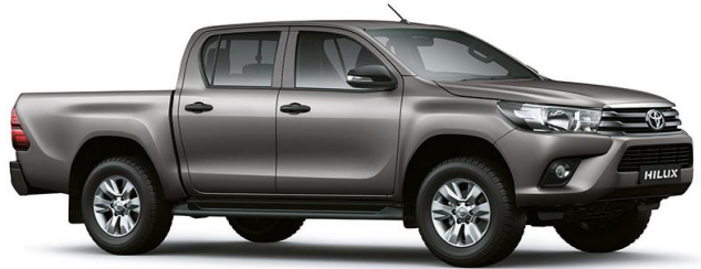
4V8 Avant-Garde Bronze Metallic