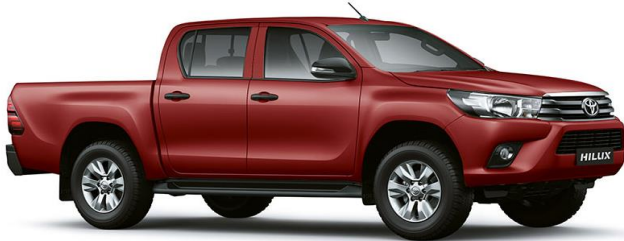
3T6 Red Metallic