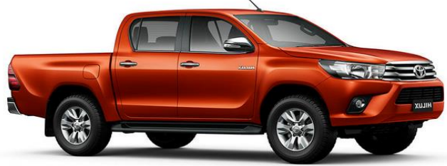
4R8 Orange Metallic