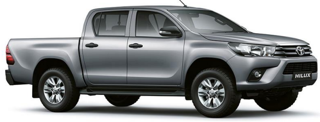
1D6 Silver Metallic